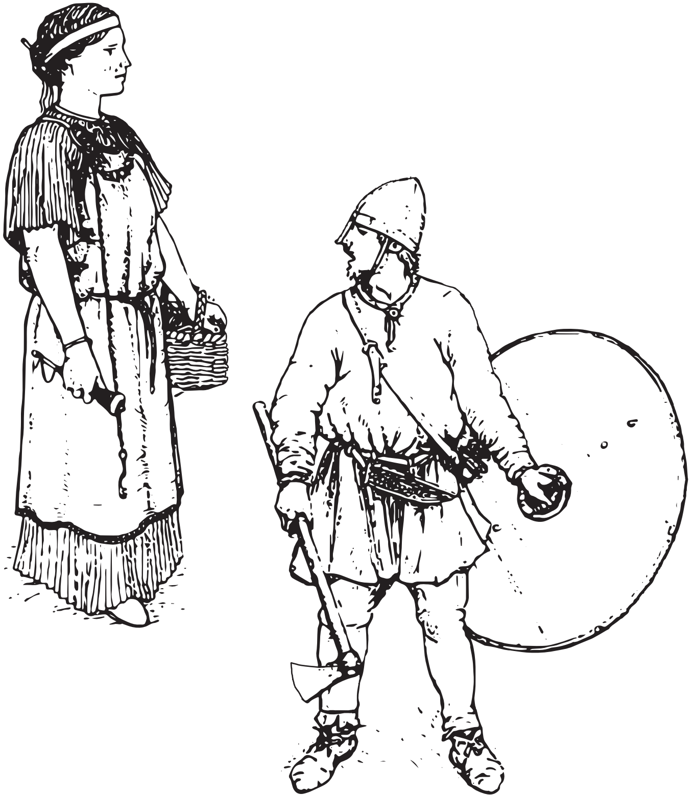
THIS IS A VIKING LADY AND A VIKING WARRIOR